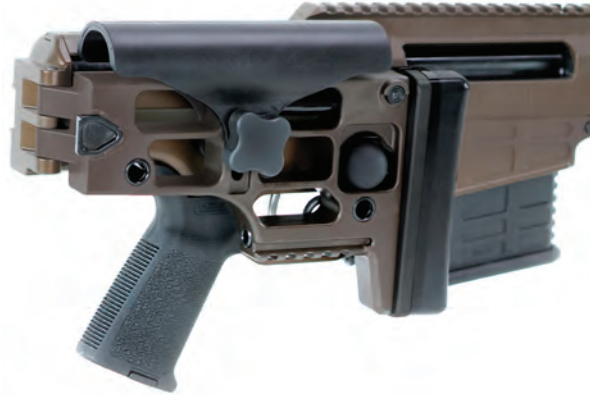
During transport the stock folds and locks onto the bolt handle maintaining the same rifle width whether folded or extended.

From its quick-detach sling mounts to colors that blends into any environment – every detail of the MRAD has been carefully designed to create one thing: a high-performance rifle you can truly make your own.